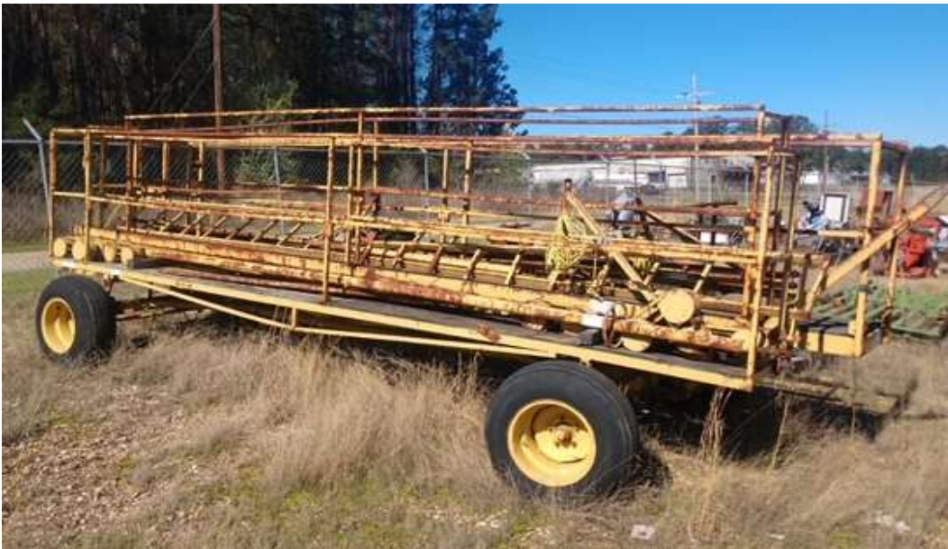
35. Rustgo work platform 32' working height 3 work platforms. Breaks down and assembles with 2 men, and adapts to unlevel ground